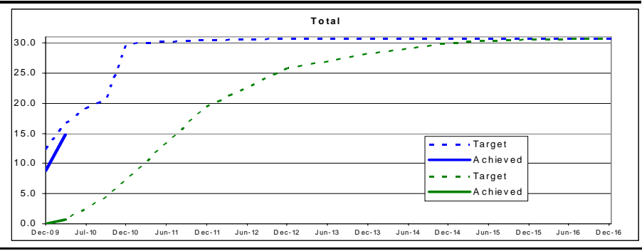
Chart 1. S-Curves for Overall Contract Awards and Disbursement